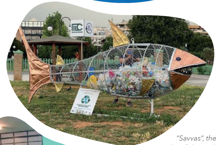
"Savvas", the first "recycling fish" in Alimos