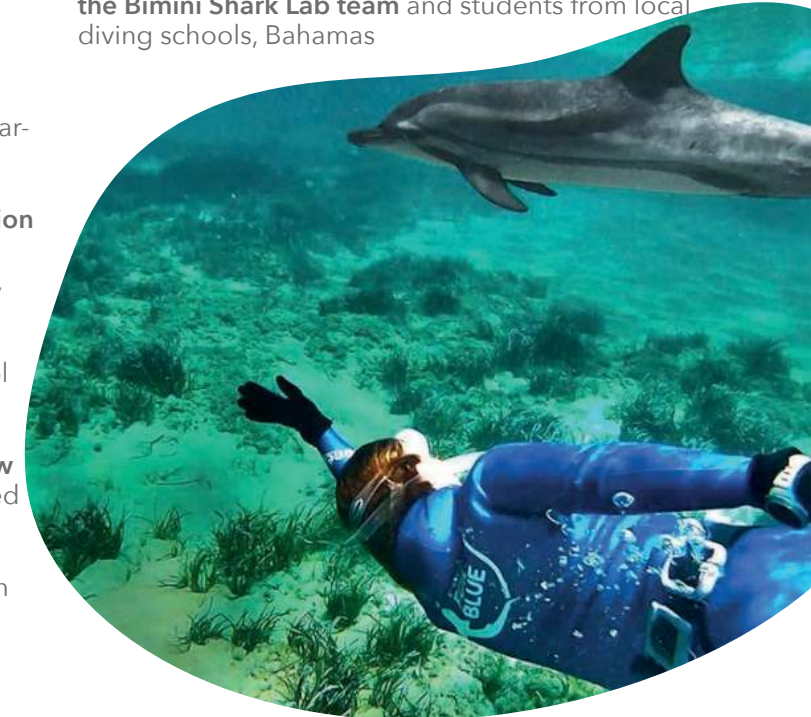
Dolphin reintegration in the Cyclades