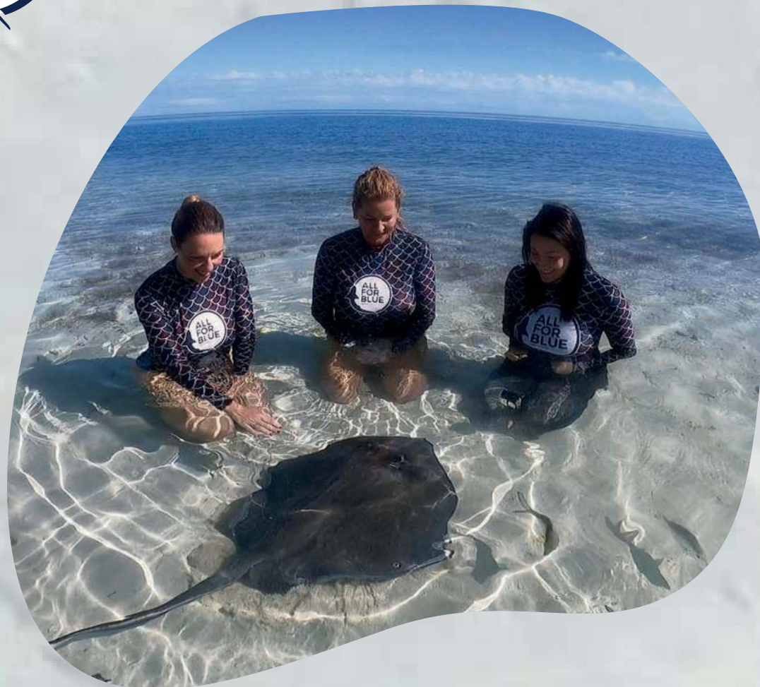
Bahamas, research project