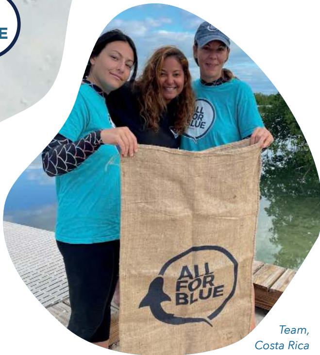
Team, Costa Rica